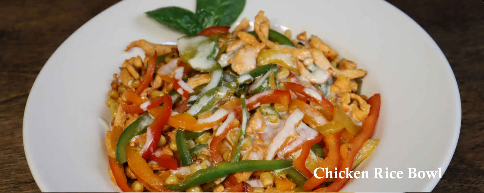
Chicken Rice Bowl