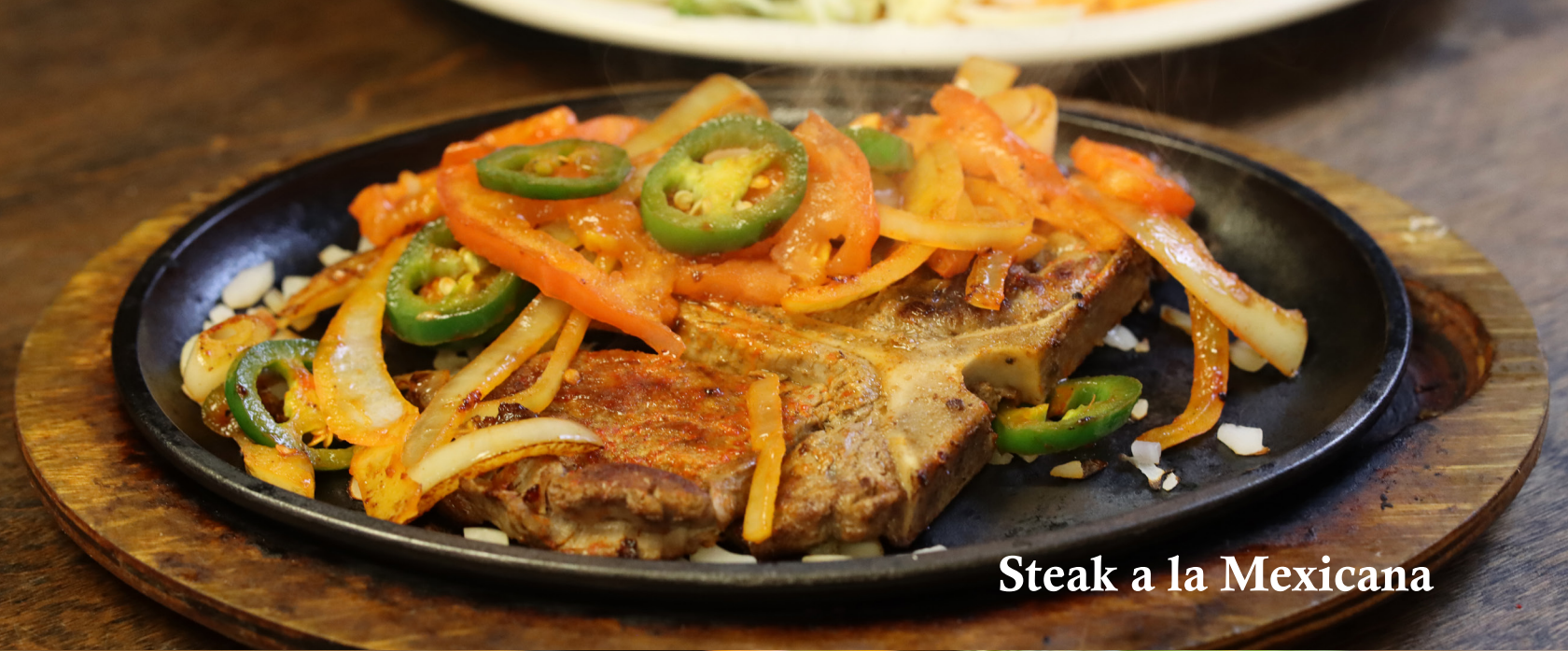
Steak a la Mexicana