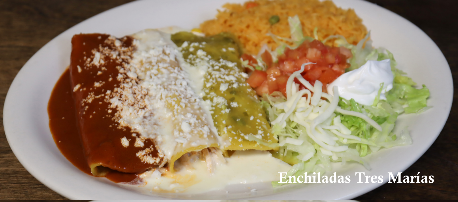
Enchiladas Tres Marías